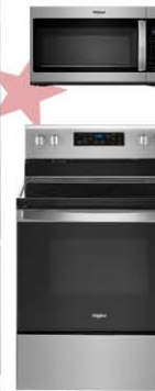
1.9 cu.ft. Over-the-Range Microwave with Microwave Presets WMH32519HZ