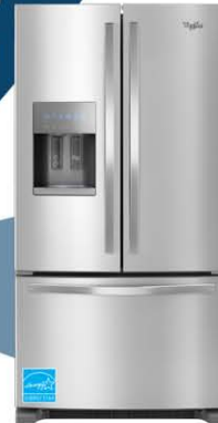
25 cu.ft. French Door Refrigerator with Exterior Ice & Water Dispenser WRF55580FZ

FINGERPRINT RESISTANT STAINLESS STEEL SUITE