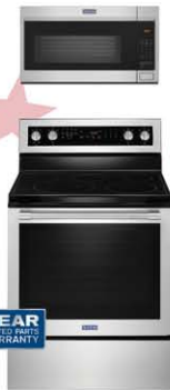
1.7 cu.ft. Over-the-Range Microwave with Stainless Steel Cavity MMV1175JZ