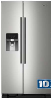
25 cu.ft. Side-by-Side Refrigerator with Gallon Door Bins MRSF4036PZ

FINGERPRINT RESISTANT STAINLESS STEEL SUITE