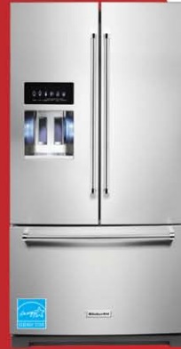
26.8 cu.ft. French Door Refrigerator with SatinGlide® Crispers KRFF577KPS