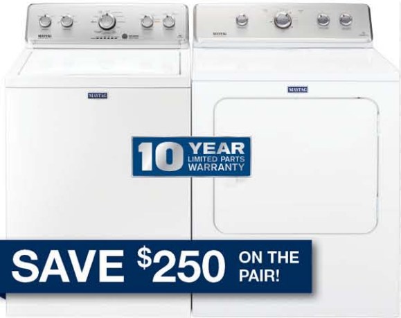
4.2 cu.ft. Large Capacity Top Load Washer with Deep Water Wash Option MVWC565FW 7.0 cu.ft. Large Capacity Electric Dryer with Heavy-Duty Motor MEDC465HW

MAYTAG® $649 Washer Reg $799 Dryer Reg $749 each