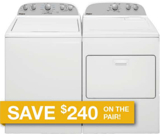
3.9 cu.ft. Top Load Washer with Soaking Cycles WTW4950HW 7.0 cu.ft. Electric Dryer with AutoDry™ Drying System WED4950HW

MAYTAG® $649 Washer Reg $799 Dryer Reg $749 each