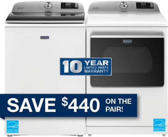
5.2 cu.ft. Smart Top Load Washer with Extra Power Button MVW7230HW 7.4 cu.ft. Smart Electric Dryer with Extra Power Button MED7230HW