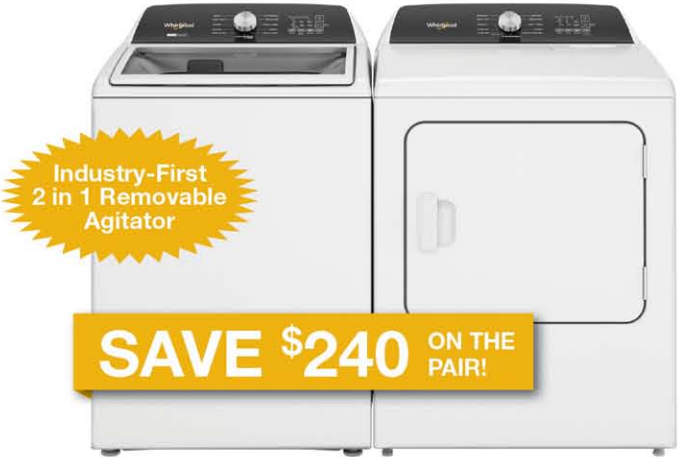
4.7-4.8 cu.ft. Top Load Washer with Removable Agitator WTW5057LW 7.0 cu.ft. Electric Dryer with Steam Refresh Cycle WED5050LW