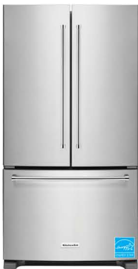
20 cu.ft. Counter-Depth French Door Refrigerator with Interior Water Dispenser KRFC300ESS

4-PIECE KITCHENAID® STAINLESS STEEL KITCHEN SUITE