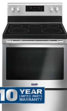
5.3 cu.ft. Electric Range with Precision Cooking™ System MER6600FZ