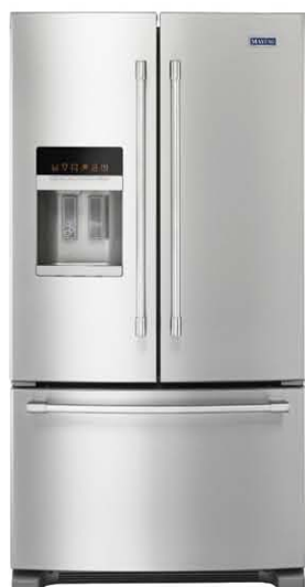
25 cu.ft. French Door Refrigerator with PowerCold® Feature MFI2570FEZ