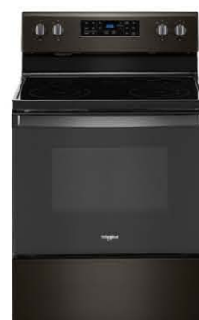
5.3 cu.ft. Electric Range with Frozen Bake™ Technology WFE535S0JV