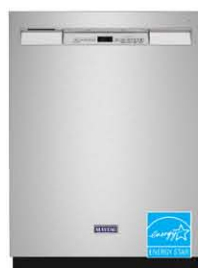
Stainless Steel Tub Dishwasher with Dual Power Filtration MDB4949SKZ