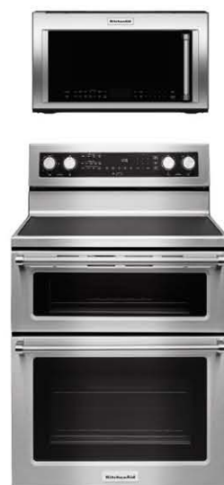
1.9 cu.ft. Convection Microwave Hood Combination with 1,000 Watts of Power KMHC319ESS