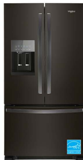
25 cu.ft. French Door Refrigerator with Spillproof Shelves WRF555SDHV