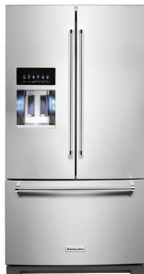
26.8 cu.ft. Standard Width French Door Refrigerator with PrintShield™ Finish KRFF507HPS