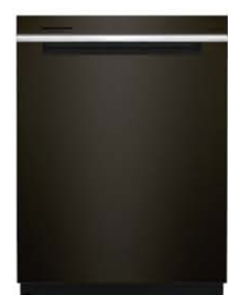
Large Capacity Dishwasher with Third Rack WDTA50SAKV

Selling & Servicing Major Appliances in Tucson Since 1956