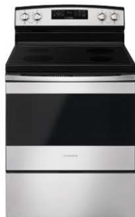
4.8 cu.ft. Electric Range with Extra-Large Oven Window AER6303MFS