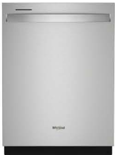
Stainless Steel Dishwasher with Third Level Rack WDT750SAKZ