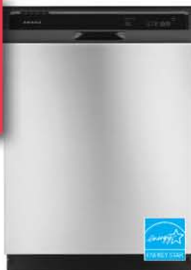
Stainless Steel Dishwasher with 1-Hour Wash Cycle ADB1400AGS