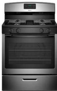
5.1 cu.ft. Gas Range with Easy Touch Electronic Controls AGR5330BAS