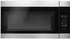
1.6 cu.ft. Over-the-Range Microwave with Add :30 Seconds Feature AMV2307PFS