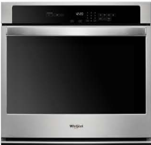
5.0 cu.ft. Single Wall Oven with the FIT system WOS31ES0JS