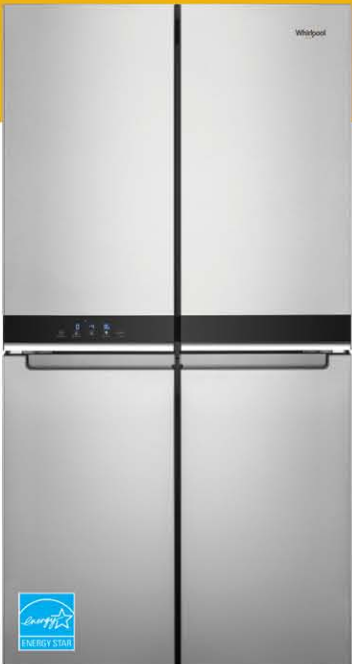
19.4 cu.ft. Counter Depth 4 Door Refrigerator with Flexible Organization Spaces WRQA59CNKZ