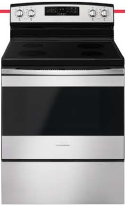
4.8 cu.ft. Electric Range with Extra-Large Oven Window AER6303MFS