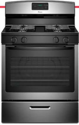
5.1 cu.ft. Gas Range with Easy Touch Electronic Controls AGR5330BAS