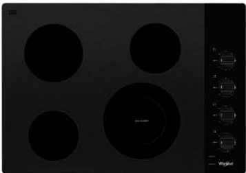
30" Electric Ceramic Glass Cooktop with Dual Radiant Element WCE55US0HB