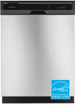
Stainless Steel Dishwasher with 1-Hour Wash Cycle ADB1400AGS