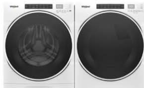
5.0 cu.ft. Front Load Washer with Load & Go™ XL Dispenser & Intuitive Controls WFW8620HW