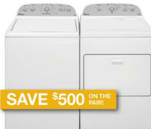
4.3 cu.ft. Top Load Washer with Presoak Option & Deep Water Wash Cycle WFW5000DW