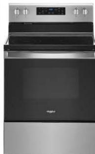
5.3 cu.ft. Electric Range with Frozen Bake™ Technology WFE525S0JZ WFG525S0JZ - Gas add $111