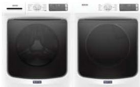
4.5 cu.ft. Front Load Washer with Extra Power & 12-Hr Fresh® Hold Option MHW5630HW