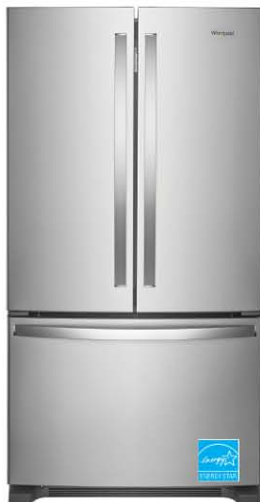
25 cu.ft. French Door Refrigerator with Humidity-Controlled Crispers WRF535SWHZ