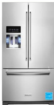
26.8 cu.ft. French Door Refrigerator with Exterior Ice and Water KRFF507HPS

BY MAIL WITH PURCHASE OF SELECT KITCHENAID® BRAND APPLIANCES* Valid January 1 - July 11, 2020