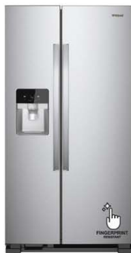
25 cu.ft. Side-by-Side Refrigerator with Frameless Glass Shelves WRS3258CHZ