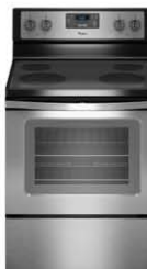
4.8 cu.ft. Electric Range with FlexHeat™ Dual Radiant Element WFE320M0ES WFG320M0BS - Gas same price