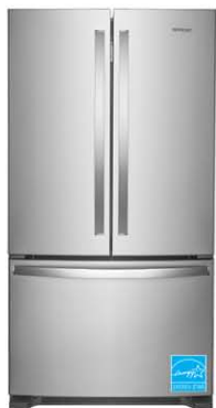
25 cu.ft. French Door Refrigerator with Humidity-Controlled Crispers WRF4355SWHZ