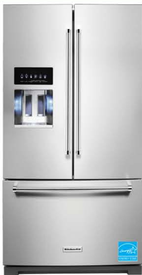
26.8 cu.ft. French Door Refrigerator with Exterior Ice and Water KRFF507HPS