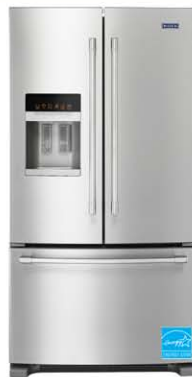
25 cu.ft. French Door Refrigerator with PowerCold® Feature MF12570FEZ