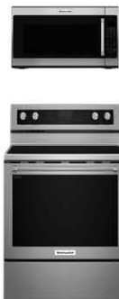
2.0 cu.ft. Over-the- Range Microwave with Sensor Functions KMHF120ESS