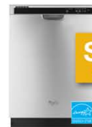
Stainless Steel Dishwasher with 1-Hour Wash Cycle WDF520PADM