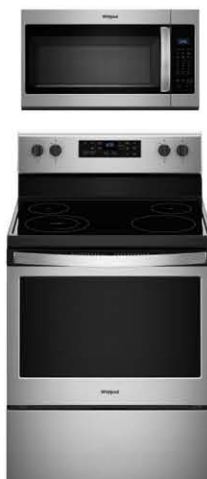
1.7 cu.ft. Microwave Hood Combination with Electronic Touch Controls WMH31017HS