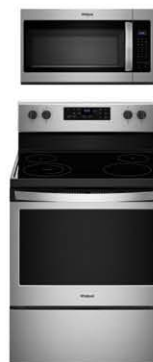
1.7 cu.ft. Microwave Hood Combination with Electronic Touch Controls WMH31017HS