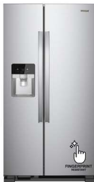
25 cu.ft. Side-by-Side Refrigerator with Frameless Glass Shelves WRS32SDHZ