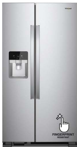
25 cu.ft. Side-by-Side Refrigerator with Frameless Glass Shelves WRS325SDHZ