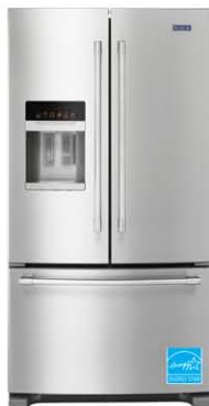
25 cu.ft. French Door Refrigerator with PowerCold® Feature MF25T0FEZ