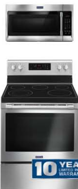
1.7 cu.ft. Compact Over-the-Range Microwave with Flush Hidden Vent MMV1174FZ