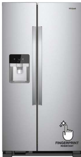
25 cu.ft. Side-by-Side Refrigerator with Frameless Glass Shelves WRS325SDHZ