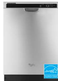
Stainless Steel Dishwasher with 1-Hour Wash Cycle WDF520PADM