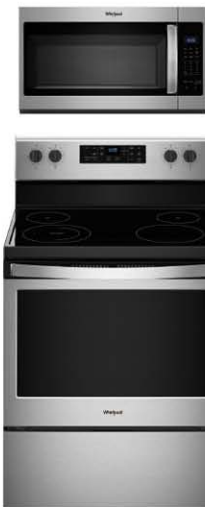
1.7 cu.ft. Microwave Hood Combination with Electronic Touch Controls WMH31017HS