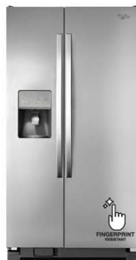
25 cu.ft. Side-by-Side Refrigerator with Frameless Glass Shelves WRS325SDHZ