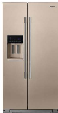
21 cu.ft. Counter Depth Side-by-Side Refrigerator with Frameless Glass Shelves WRS471CIHN

FINGERPRINT RESISTANT SUNSET BRONZE KITCHEN