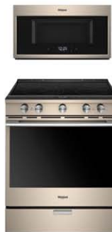
1.9 cu.ft. Smart Over-the-Range Microwave with Scan-to-Cook Technology WMHA9019HN