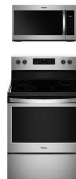
1.7 cu.ft. Microwave Hood Combination with Electronic Touch Controls WMH31017HS