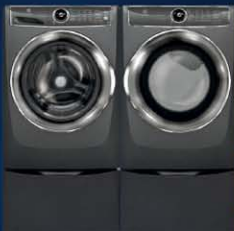
EFL562TUTT / EFHE62TUTT Shown on optional pedestal EPWD25TUTT sold separately

Exclusive SmartBoost® technology provides the most effective stain removal.*