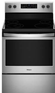
5.3 cu.ft. Electric Range with FlexHeat™ Dual Radiant Element WFE505W0HS WFG505M0BS - Gas add $111