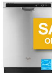
Stainless Steel Dishwasher with 1-Hour Wash Cycle WDF520PADM