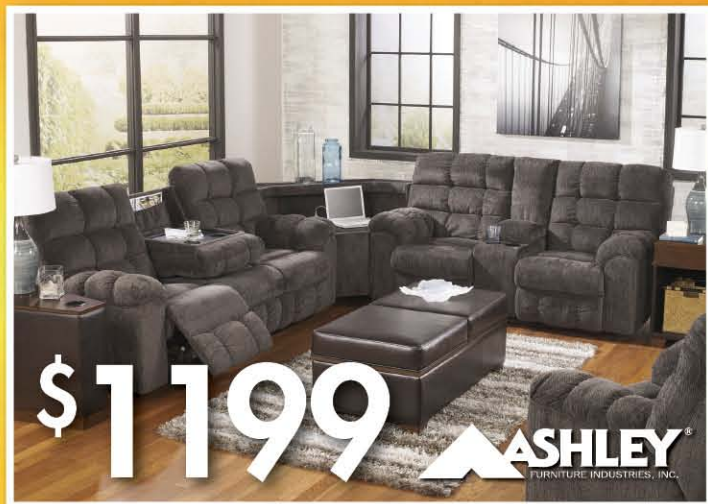
ASHLEY FURNITURE® ACIEONA 3-PIECE SECTIONAL with Dual-Sided Recliner and Drop-Down Center Table APK-58300-S3

HURRY IN TO ENJOY THESE AMAZING SAVINGS!