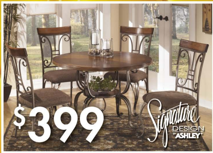
SIGNATURE DESIGN BY ASHLEY FURNITURE® PLENTYWOOD ROUND DINING TABLE with Round Center Shelf Showcase D313-15