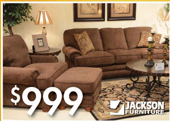
JACKSON FURNITURE® BRADDOCK ESPRESSO SOFA AND LOVESEAT with Reversible Seat Cushions and Attached Bordered Backs 4238