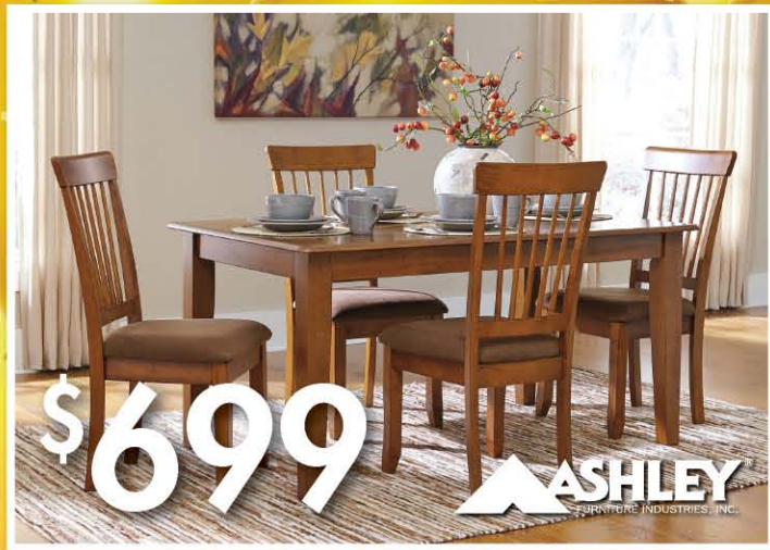
ASHLEY FURNITURE® RUSTIC BROWN DINING TABLE & FOUR CHAIRS with Stylishly Tapered Legs to Fit Any Aesthetic D199-25, D199-01