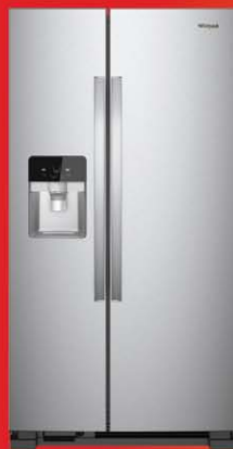
24.6 cu.ft. Side-by-Side Refrigerator with Humidity-Controlled Crispers WRB32SSDHZ