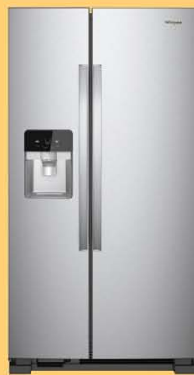
24.6 cu.ft. Side-by-Side Refrigerator with Humidity-Controlled Crispers WRS325BDHZ

on Odds 'n Ends, Open Box and Select Closeouts!