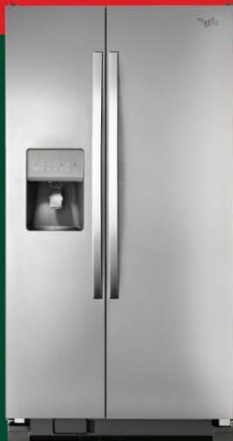
25 cu.ft. Side-by-Side Refrigerator with SpillGuard™ Glass Shelves WRS325FDAM