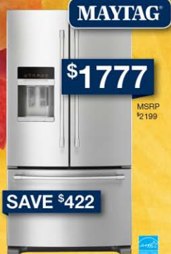
25 cu.ft. French Door Refrigerator with PowerCold® Feature MF1250FEZ