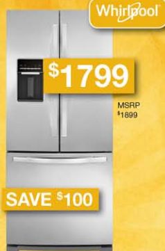
19.7 cu.ft. French Door Refrigerator with Exterior Water Dispenser WRF560SEYM

SAVE AN ADDITIONAL 10% ON SELECT CLOSEOUT MODELS