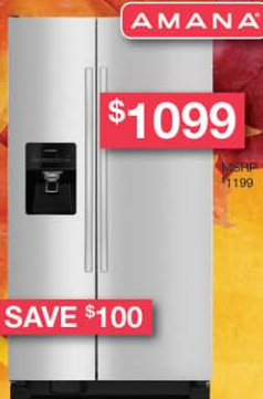
24 cu.ft. Side-by-Side Refrigerator with Gallon Door Storage Bins AS12575FRS