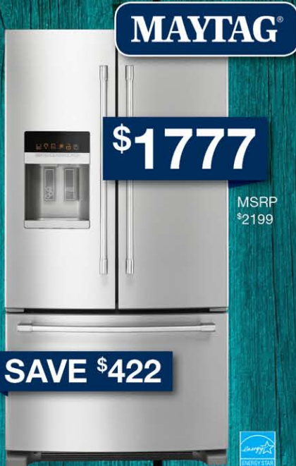
25 cu.ft. French Door Refrigerator with PowerCold® Feature MFI2570FEZ