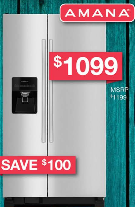
24 cu.ft. Side-by-Side Refrigerator with Gallon Door Storage Bins ASI2575FRS