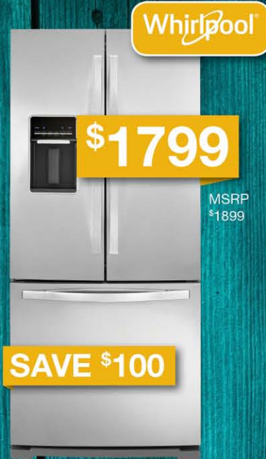
19.7 cu.ft. French Door Refrigerator with Exterior Water Dispenser WRF560SEYM

SAVE AN ADDITIONAL 10% ON SELECT CLOSEOUT MODELS