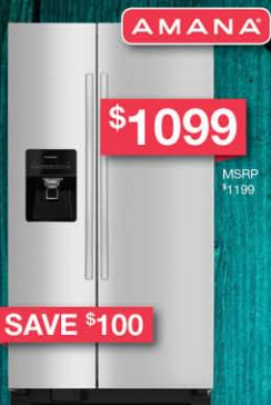
24 cu.ft. Side-by-Side Refrigerator with Gallon Door Storage Bins AS12575FBS