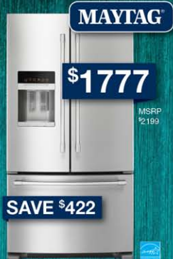
25 cu.ft. French Door Refrigerator with PowerCold® Feature MFI2570FEZ