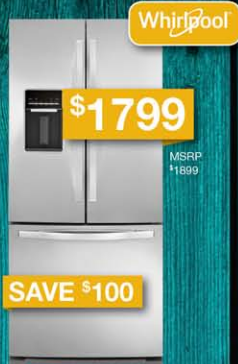
19.7 cu.ft. French Door Refrigerator with Exterior Water Dispenser WRF560SEYM

SAVE AN ADDITIONAL 10% ON SELECT CLOSEOUT MODELS