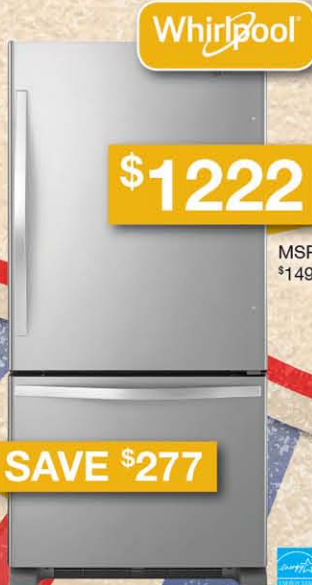
22 cu.ft. Bottom Freezer Refrigerator with SpillGuard™ Glass Shelves WRB322DMBM