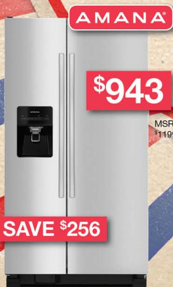
24 cu.ft. Side-by-Side Refrigerator with Gallon Door Storage Bins ASI2575FRS