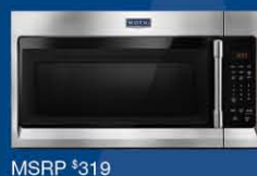
MAYTAG® 1.7 cu.ft. Compact Over-the-Range Microwave with Fingerprint Resistant Stainless Steel MMV1174FZ