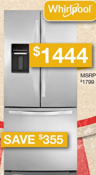
19.7 cu.ft. French Door Refrigerator with Exterior Water Dispenser WRF560SEYM

SAVE AN ADDITIONAL 10% ON SELECT CLOSEOUT MODELS