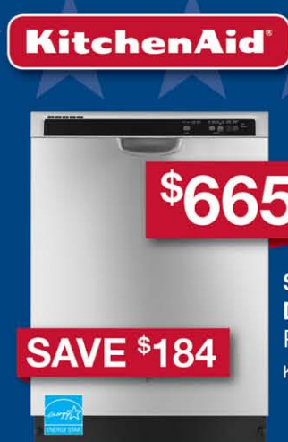
Stainless Steel Dishwasher with ProWash™ Cycle KDPE104DSS