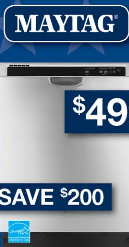
Stainless Steel Tub Dishwasher with PowerBlast™ Cycle MDB4949SDZ

BUYING POWER – We are a member of a Multi-Billion Dollar buying organization. The majority of our appliances are priced at or below home improvement store prices. Don't sacrifice quality service before or after the sale. BUY FROM A LOCALLY OWNED BUSINESS!