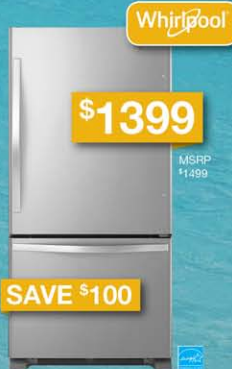
22 cu.ft. Bottom Freezer Refrigerator with SpillGuard™ Glass Shelves WRB322DMBM