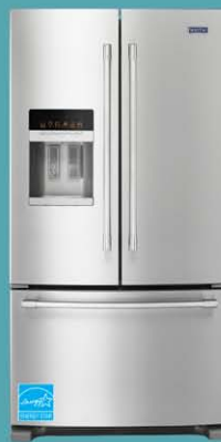
25 cu.ft. French Door Refrigerator with PowerCold™ Feature MF2570FEZ

FINGERPRINT RESISTANT STAINLESS STEEL SUITE