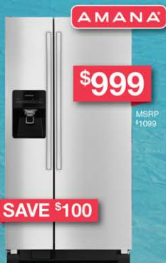
21 cu.ft. Side-by-Side Refrigerator with Gallon Door Storage Bins AS12275FRS