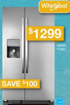
25 cu.ft. Side-by-Side Refrigerator with SpillGuard™ Glass Shelves WRS325FDAM