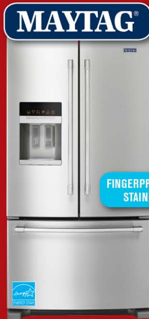
25 cu.ft. French Door Refrigerator with PowerCold™ Feature MF12570FEZ

MAYTAG® STAINLESS STEEL MAYTAG KITCHEN $2999