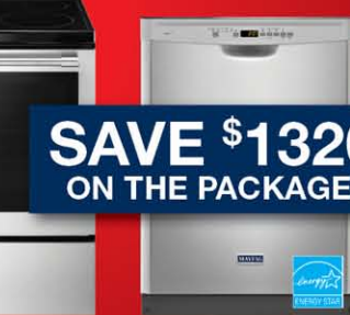
6.4 cu.ft. Electric Range with True Convection MER8800FZ MGR8800FZ - Gas Add $100