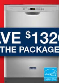
Stainless Steel Tub Dishwasher with PowerBlast™ Cycle MDB4949SDZ