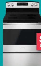
4.8 cu.ft. Electric Range with Extra-Large Oven Window AER6303MFS