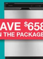
Stainless Steel Dishwasher with Triple Filter Wash System ADB1300AFS