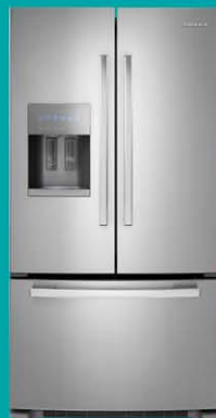
25 cu.ft. French Door Refrigerator with Fast Cool Option AFI2530ERM