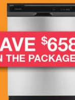
Stainless Steel Dishwasher with Triple Filter Wash System ADB1300AFS