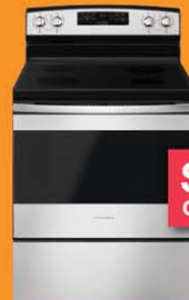
4.8 cu.ft. Electric Range with Extra-Large Oven Window AER6303MFS