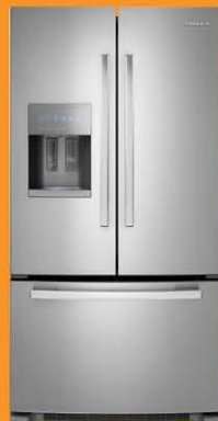
25 cu.ft. French Door Refrigerator with Fast Cool Option AF2530ERM