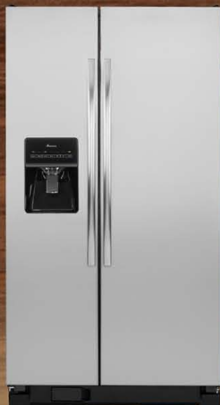
25.5 cu.ft. Side-By-Side Refrigerator with Gallon Door Storage Bins ASD2575BRS