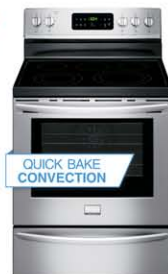
30" Freestanding Electric Range with Quick Bake Convection FGEF3035RF