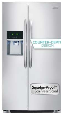
22.2 Cu. Ft. Counter Depth Side by Side Refrigerator with Adjustable Interior Storage FGH4C2331PF

PLUS Up To $150 Delivery Rebate (Good 11/20-11/30)*