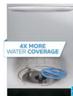
Fully Integrated Dishwasher with OrbitClean™ Spray Arm FGD2466QF