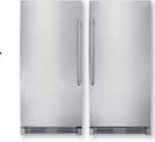
All refrigerator & all freezer