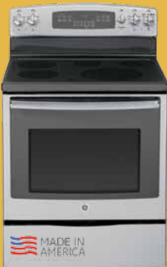
GE® 30" Electric Convection Range