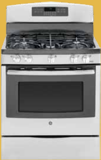
GE® 30" Gas Convection Range