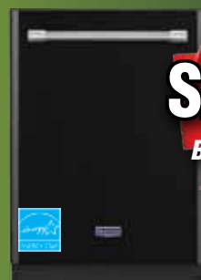
Durable Large Capacity Dishwasher with 4-Blade Stainless Steel Chopper MDB5969SDE