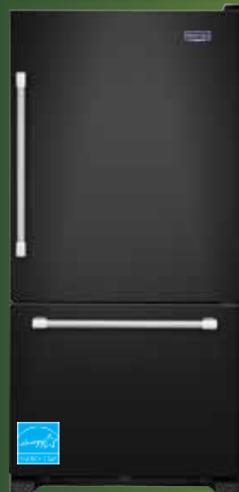
22.1 cu.ft. Bottom Freezer Refrigerator with FreshLock™ Crispers MBF2258DEE