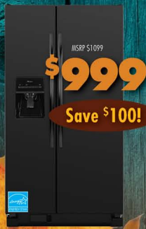
AMANA® 25.5 CU.FT. SIDE-BY-SIDE REFRIGERATOR with Adjustable Gallon Door Bins ASD2575BRB