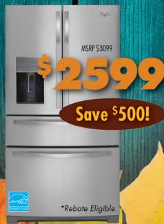
WHIRLPOOL® 28.1 CU.FT. FRENCH DOOR REFRIGERATOR with External Water and Ice Dispenser WRX988SIBM