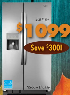
WHIRLPOOL® 25.4 CU.FT. SIDE-BY-SIDE REFRIGERATOR with Spill-Proof Glass Shelves WRS325FDAM