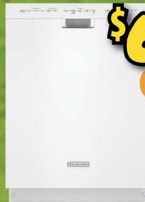
WHIRLPOOL GOLD® STAINLESS STEEL DISHWASHER with Sensor Cycle WDT710PAYM