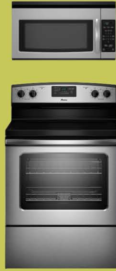
AMANA® 1.5 CU.FT. OVER-THE-RANGE MICROWAVE with 1,000 Cooking Watts AMV1150VAS