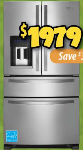
WHIRLPOOL® 26 CU.FT. FRENCH DOOR REFRIGERATOR with MicroEdge® Shelves WRF736SDAM