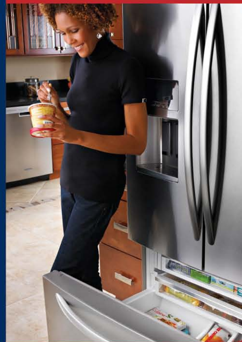
WHIRLPOOL® 28 CU.FT. 4-DOOR REFRIGERATOR with FreshStor™ Refrigerated Drawer WRX988SIBM