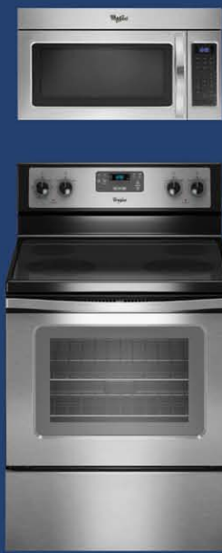
WHIRLPOOL® 1.7 CU.FT. OVER-THE-RANGE MICROWAVE with 220 CFM Vent System WMH31017AS