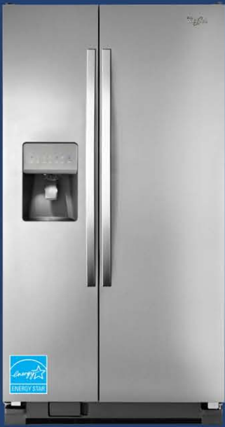
WHIRLPOOL® 25.4 CU.FT. SIDE-BY-SIDE REFRIGERATOR with Spill-Proof Glass Shelves WRS325FDAM