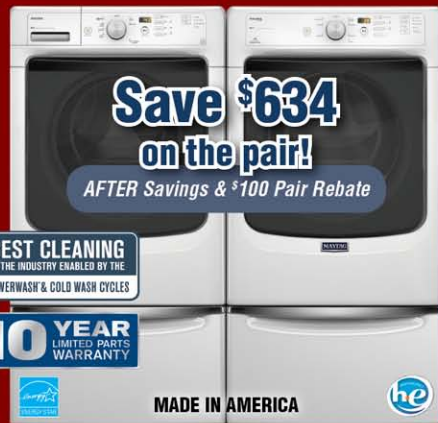
Shown On Optional Pedestals

4.5 cu.ft. Maxima® Front Load Washer with PowerWash® Cycle